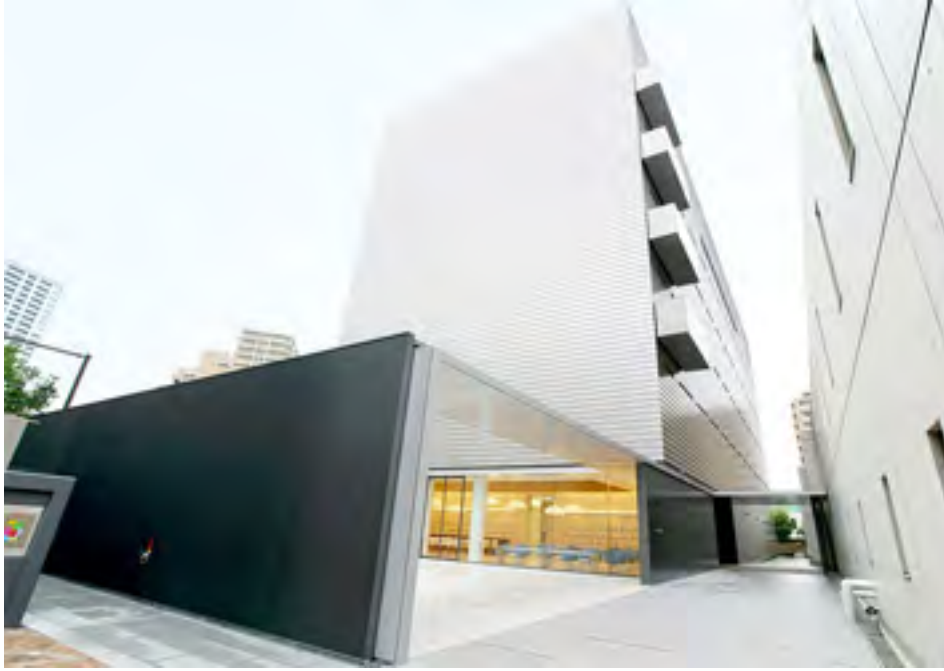
Ensemble City Building, room C201