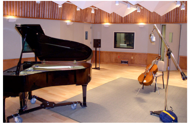
Figure 3. Soundhouse A.

opportunities for music technology and composition students to be involved with the IDIA and the Center for Media Design. More information about the IDIA can be found here: http://idiarts.org/ .