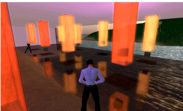
Figure 7. Second Life version of Displaced Resonance.