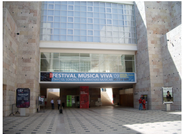
図 1. MUSICA VIVA 2009 の会場ベレム・文化センター。左手奥がコンサートホール。

リスボンといえば、石油王グルベンキアンが美術館を設立したので知られているのだが、グルベンキアン財団の助成はもっぱら古典芸術やクラシック音楽の分野に集中し、MUSICA VIVA のような現代音楽や電子音響音楽分野への助成はないという。もちろん同音楽祭は多くのスポンサーを得てはいるのだが、グルベンキアン財団の比ではない。先端芸術音楽への理解がなかなか得られにくい、という社会事情は日本だけではないようだ。そのような環境にありながら、精力的な活動を繰り広げ続ける Miso Music。ポルトガル電子音響音楽界で唯一の砦ということになる。「私はたった一人で戦っているのですよ。孤独な戦士なのです」と同氏は繰り返した。