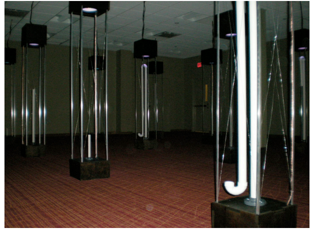
Figure 8. Displaced Resonance at the 2009 SEAMUS national conference.

Currently, I am continuing to develop technological possibilities for interactive installations, in collaboration with the Institute for Digital Intermedia Arts and with Andrew Ayers, an undergraduate assistant. Areas of interest include the use of transducers to create sound by resonating flat panels, and touch-screen interactivity