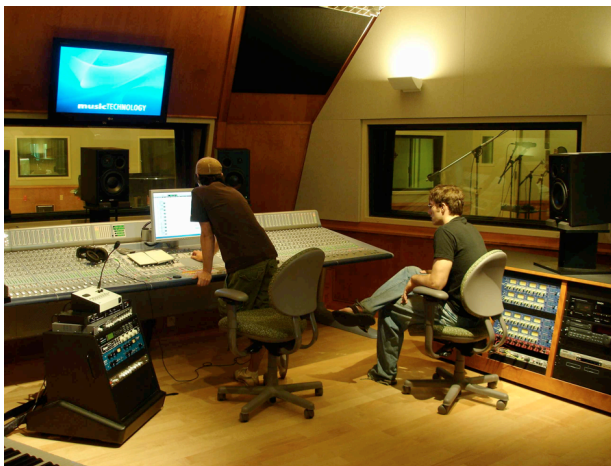
Figure 2. Studio 1.

opportunities for music technology and composition students to be involved with the IDIA and the Center for Media Design. More information about the IDIA can be found here: http://idiarts.org/ .